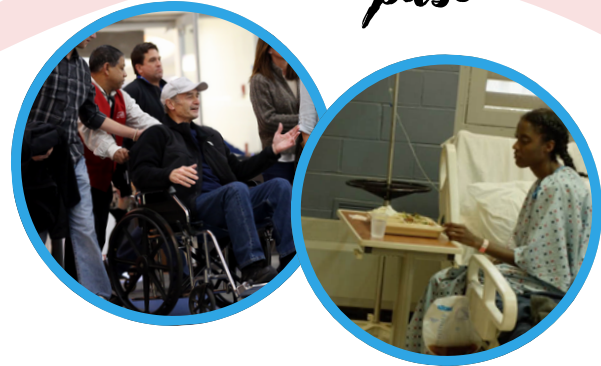
Incarcerated Citizens over 60 yrs. old

Texas is a highly punitive state, and compassion for the terminally ill, who are no danger to society, is of little consideration. Texas Prisons are full of people in high-risk categories, such as; the rapidly growing aging population, those with disabilities, and those with chronic health issues.